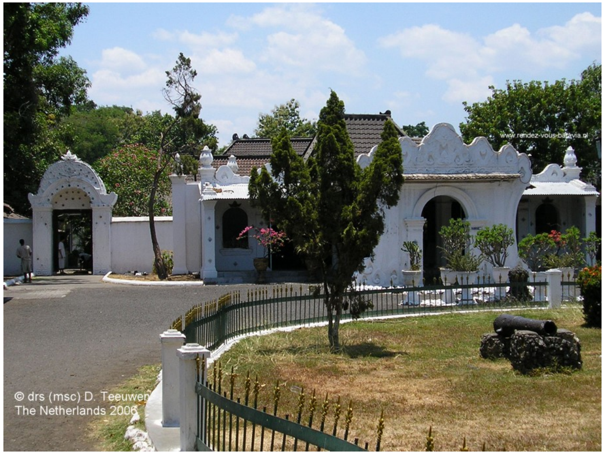
Picture 15. Kraton Kasepuhan from 1528 is a visit for the full value.