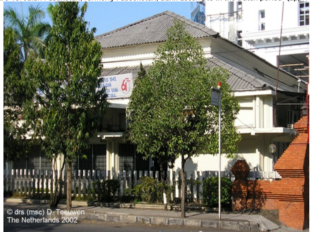
Picture 11. The colonial Clubhouse Phoenix, Sociëteit Phoenix (appr. 1925), along Jalan Yos Sudarso, formerly Tjangkolweg. There is not so much to see on this picture. But the fact, that the clubhouse survived turbulent times, is very remarkable.

Picture 10. Jalan Pasuketan, formerly Pasoeketan, Bank Escompto in the Dutch period (appr. 1920)