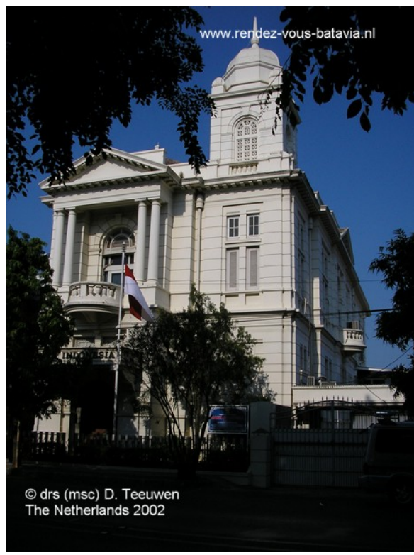
Picture 13. Bank Indonesia (1915), formerly Javasche Bank, along Jalan Yos Sudarso.