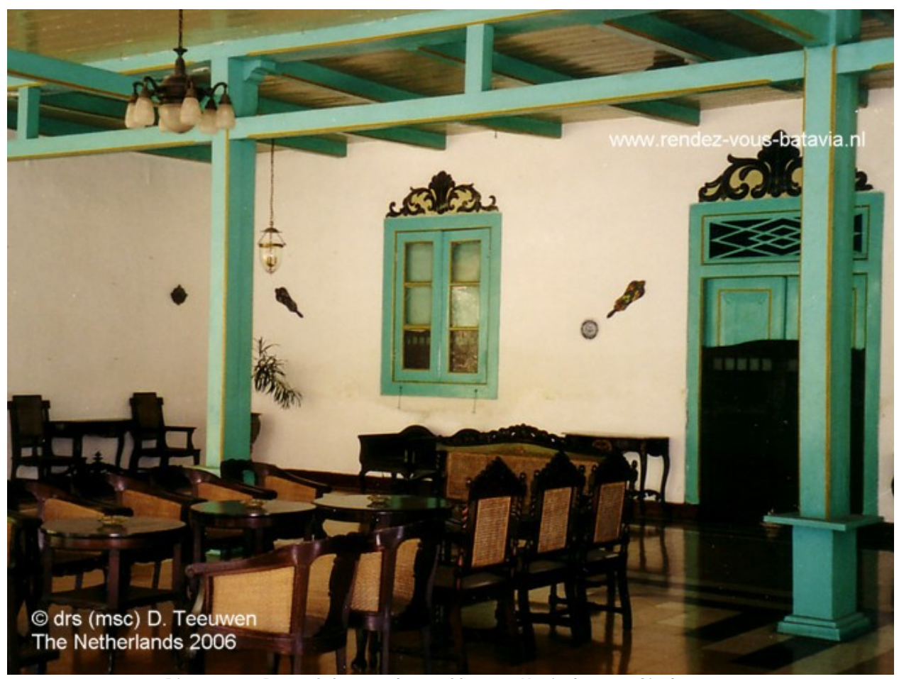
Picture 20. Part of the pendopo of kraton Kecirebonan, Cirebon. Picture 21. Mesjid, mosque, Agung close to kraton Kasepuhan from 1591.