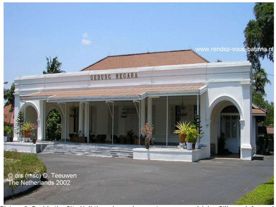
Picture 3. Beside the City Hall there is much more to see around Jalan Siliwangi, formerly Kadjaksanweg. The colonial Dutch resident's office, for example, was constructed approximately in 1880.