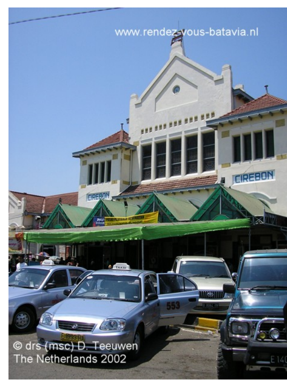
Picture 5. The front verandah of the resident's office above-mentioned. Picture 6. The business-style Dutch railway station from 1928 with its stained windows.