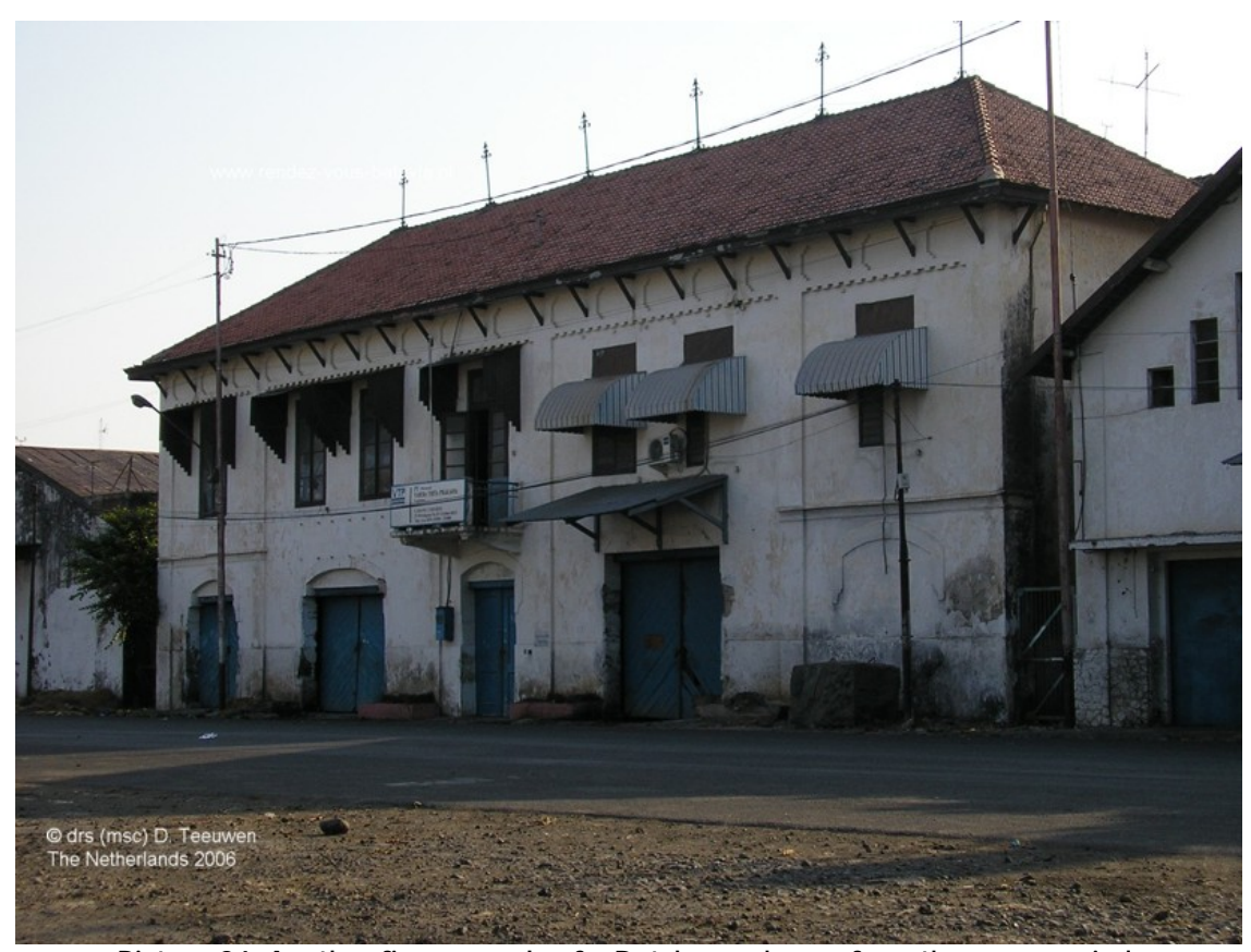
Picture 24. Another fine example of a Dutch warehouse from the same period. Picture 24. Our last one! Ofice of the harbour master(1892).