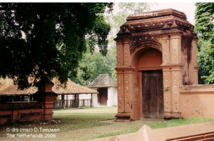
Picture 16 . A part of the interior of kraton Kasepuhan (1589) in Dutch style. Picture 17 (right) The entrance in Balinese style of kraton Kanoman.