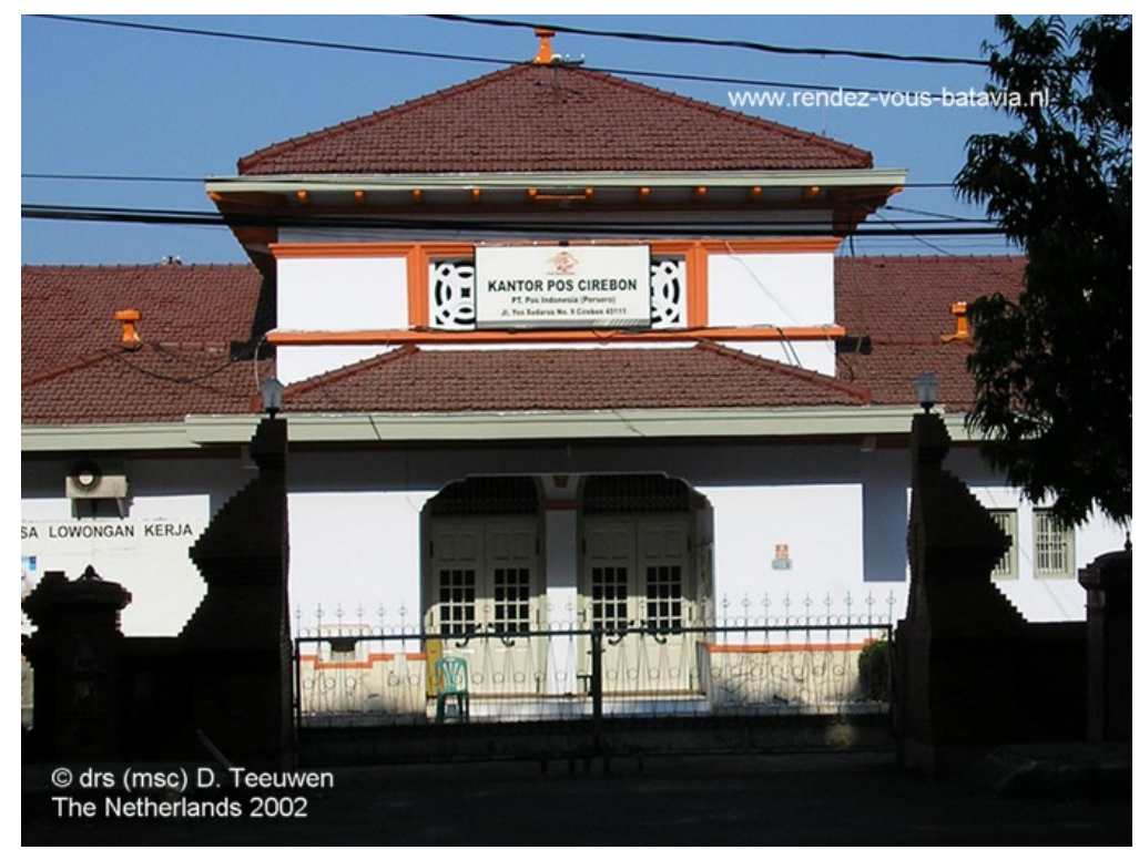
Picture 12. The Dutch (and Indonesian nowadays) post-office (appr. 1925), along present Jalan Yos Sudarsol.